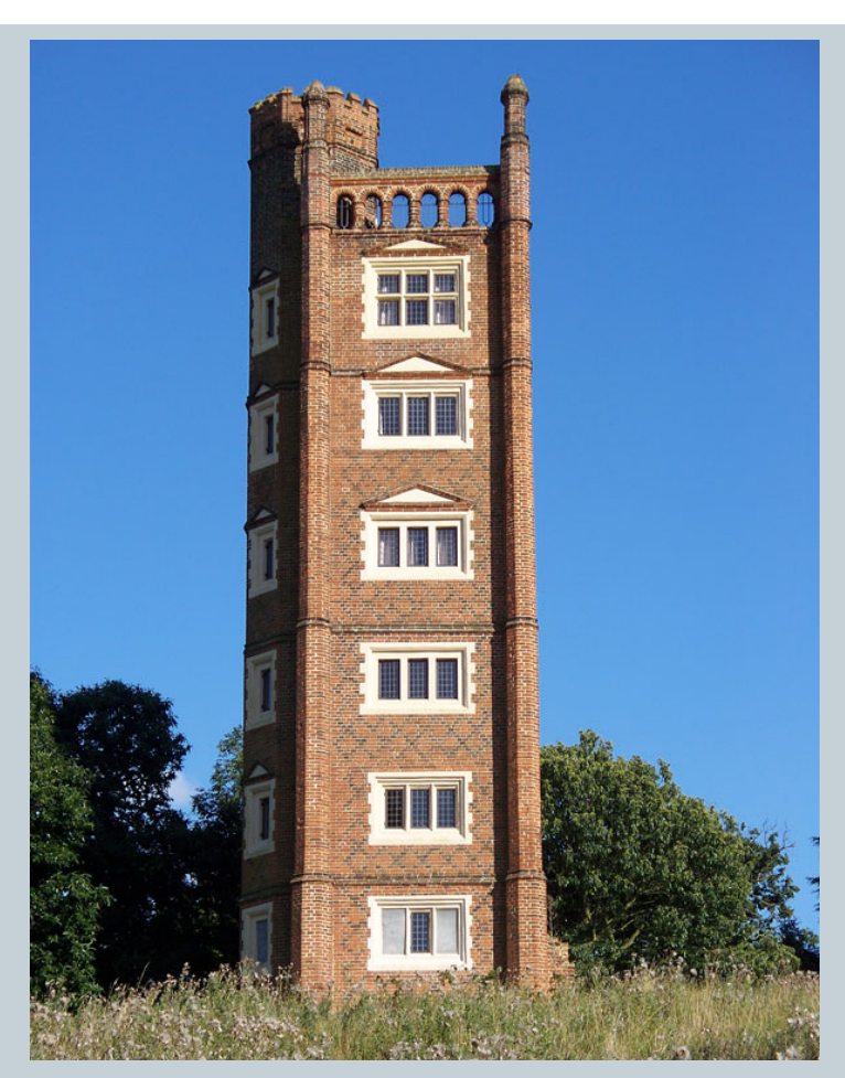
Freston Tower, Suffolk, England. Constructed c. 1578 (the oldest folly!)

The first follies date back to before 1600