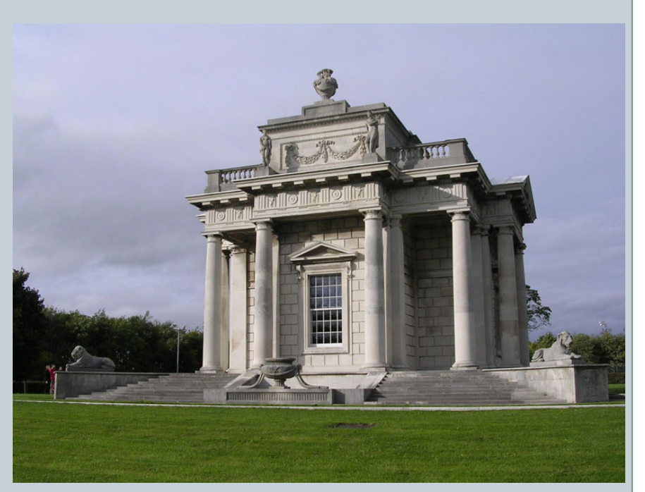
The Casino at Marino, Dublin, Ireland. 1775. Inspired by Italian Classical architecture .