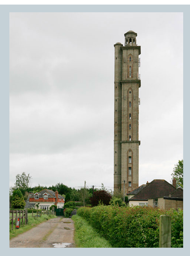
Sway Tower, or Peterson's Folly, Hampshire, England. 1885. The world's tallest non-reinforced concrete structure .