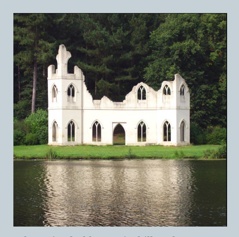
The Ruined Abbey, Painshill Park, Surrey, England. 1772. On an estate that is full of follies, this is a screen wall designed to look like a historic Gothic abbey.