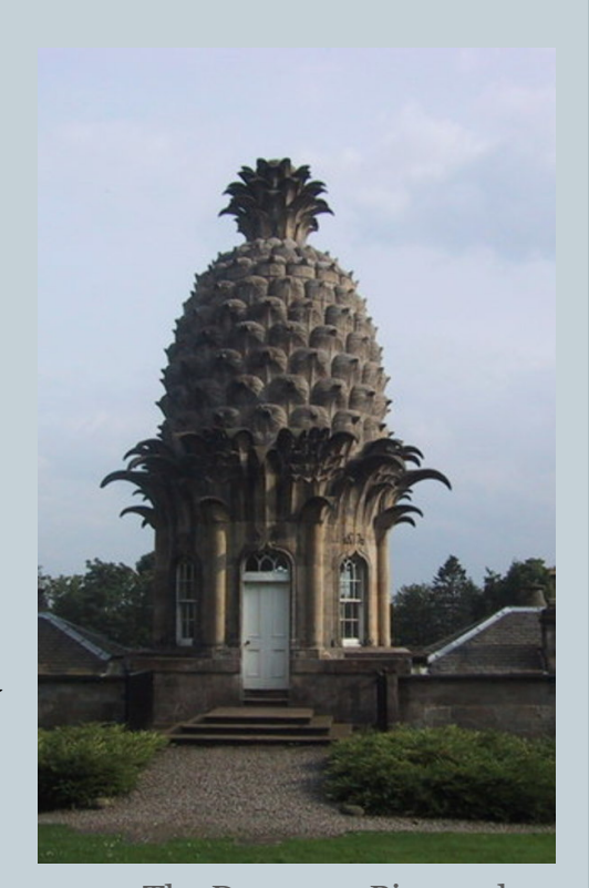
The Dunmore Pineapple, Dunmore, Scotland. Late 1700s.