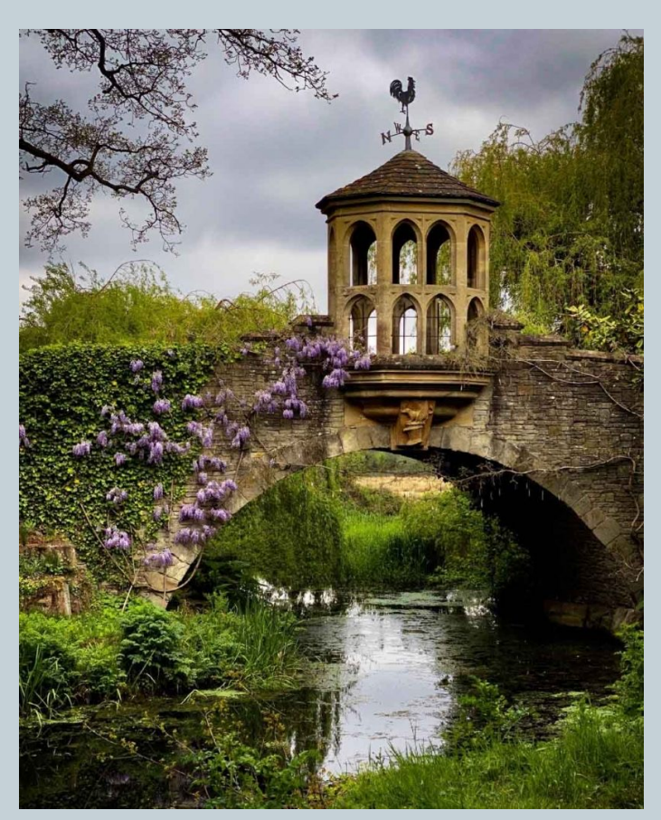
Bridge Folly, Dunsborough Park, Ripley, England. 1939. This folly crowns a bridge of this estate's Water Garden .