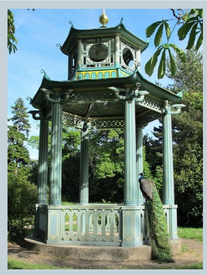
Paon et Pagadon, Bois de Boulogne, Paris, France. Inspired by East Asian architecture, this lovely green pagoda resides in Paris' largest public park.