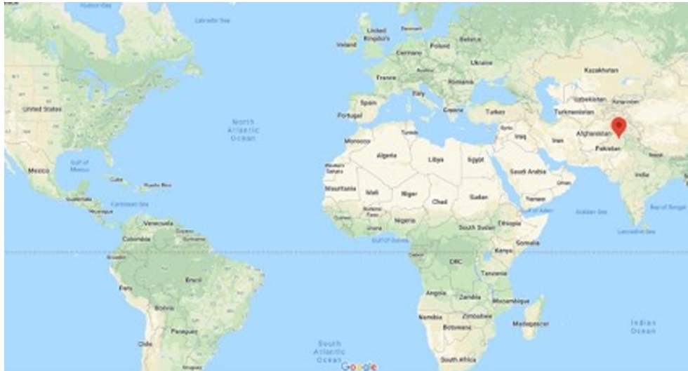
Figure 1: Developed using Google Maps

In Pakistan, agriculture is the largest sector of the economy, and all of Pakistan's people depend on farmers for their food. The main crops that are produced are wheat, sugarcane, rice, and maize. Of all the crops grown here, however, wheat is the biggest agricultural crop by far. The Sargodha region is known for being a major grain producer, and the main crop grown in this region is wheat. The season for growing wheat begins in February and runs through the beginning of August. As there is not always enough precipitation to water wheat crops throughout the growing season, wheat farmers will irrigate their wheat crops by flooding their fields with water.