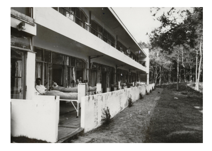
Fig. 3 Patients taking in light and fresh air.

views, and steel frames facilitated ribbon windows which allowed daylight to stream into the buildings. The plans of patient rooms were configured as fingers that reach out to the landscape for exposure to light. The flat roof became balconies with beds for the patients to rest in open daylight while taking in fresh air. Beatriz Colomina writes,