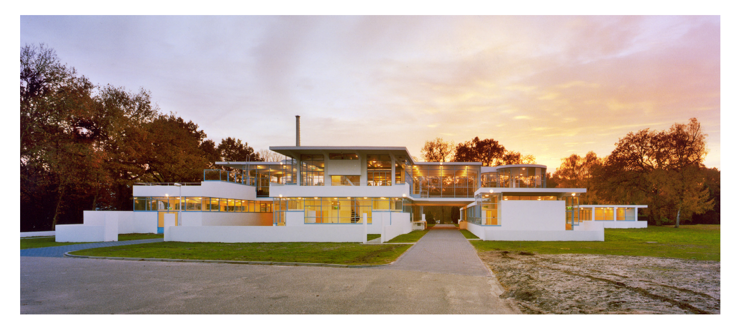
Fig. 1 Zonnestraal following restoration.

Despite its architectural significance on multiple fronts, the building was designed at a time in which scientific proofs of healing through architecture were relatively unchallenged. As Margaret Campbell