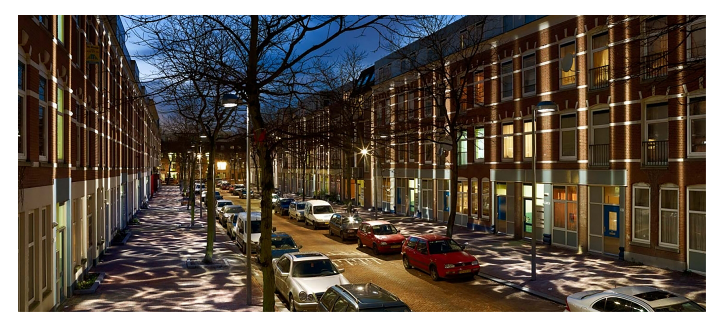
Fig 5 Broken Light in Rotterdam by Rudolf Teunissen.

the healing impact of a building-designed with care for how it brings in light, how it exposes the inhabitants to light, view, and air-is difficult to quantify.